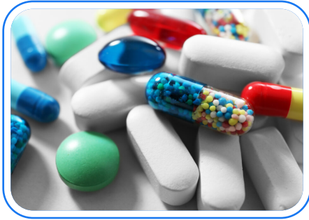
Pharmaceutical & API'S Industry