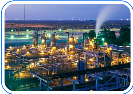
Oil Field Industry (petroleum /OIL & GAS)