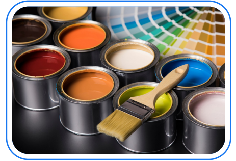
Paint & Coating Industry